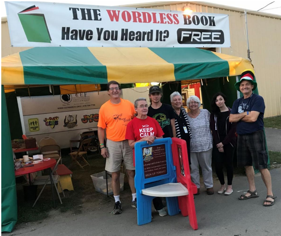
The Lord blessed our efforts at the Ashland County Fair with over 600 children reached with the Gospel. We had great weather all week and there were 80 kids saved and 24 assured of their salvation!