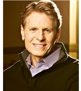
Steve Green In Concert 4/13/18