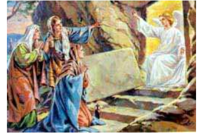
The angel said, “ He is not here, for He has RISEN! ” (Matthew

Non-Profit Org. U.S. Postage PAID Mansfield, Ohio Permit #385