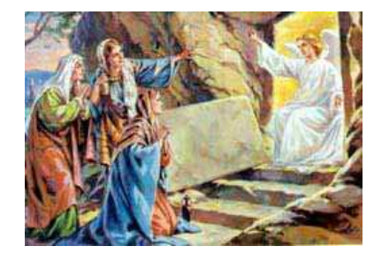
The angel said, "He is not here, for He has RISEN!" (Matthew

Non-Profit Org. U.S. Postage PAID Mansfield, Ohio Permit #385