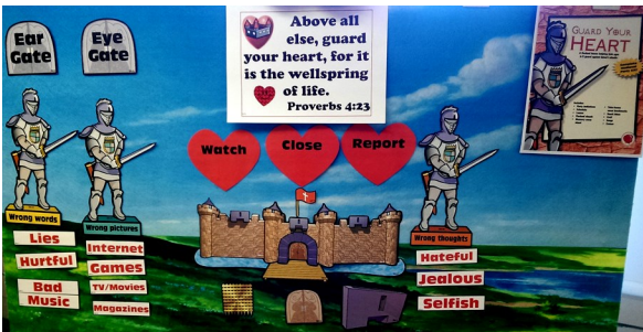
Valentine's Guard Your Heart Lesson!

I am always in awe of how God works in the lives of the children in Good News Clubs. The powerful Valentine lesson was on guarding one's heart. After I taught that