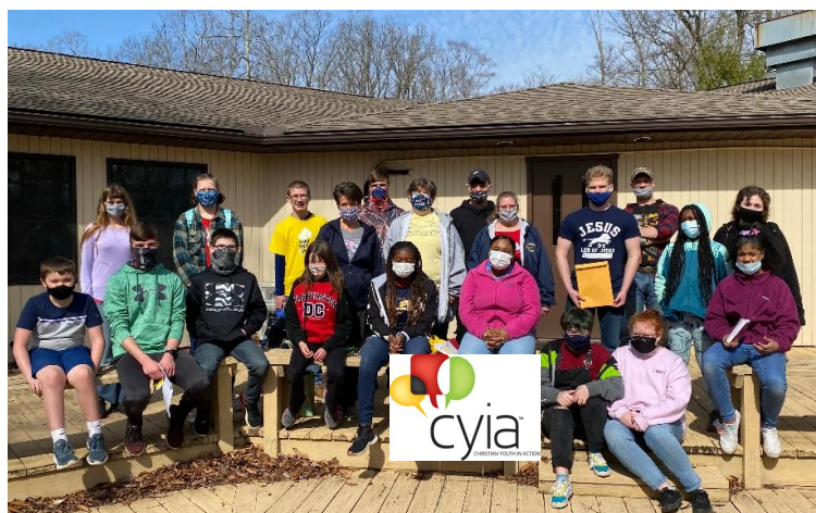
Teens at the CYIA Spring Retreat—2021

The Lord blessed the 2021 State wide Christian Youth In Action® (CYIA™) Spring Retreat at Inspiration Hills Camp with renewed relationships and excitement for reaching children again this summer with the gospel.