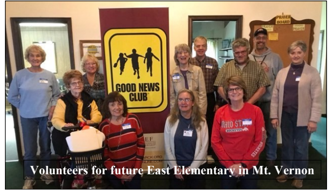
Volunteers for future East Elementary in Mt. Vernon

God's Word is being shared with children in Mount Vernon Schools. Lakeholm Church of the Nazarene has partnered with CEF to start the Good News Club at Twin Oak Elementary School. This club started with about a dozen children. The very first day of club, four children responded to the Bible lesson invitation. Two of them asked Jesus to be their Savior for the first time and two were assured of their