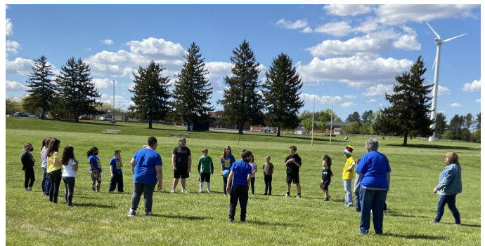
The above was from the last day of Good News Club in Ontario

5-Day Club and next year's Good News Club will continue to be places to foster growth.