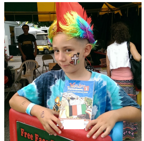
This colorful boy asked Jesus to be his Savior at the Richland County Fair.

You can help this summer at any of our 7 fairs and help children put their trust in the Lord Jesus through face painting and sharing the Wordless Book. Call 419-756-7799 for a summer fair schedule. Thanks!