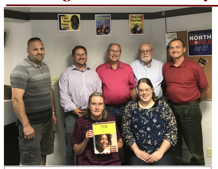
TCETM Class of 2019

It was refreshing to see this class of students do so well in this course this fall.