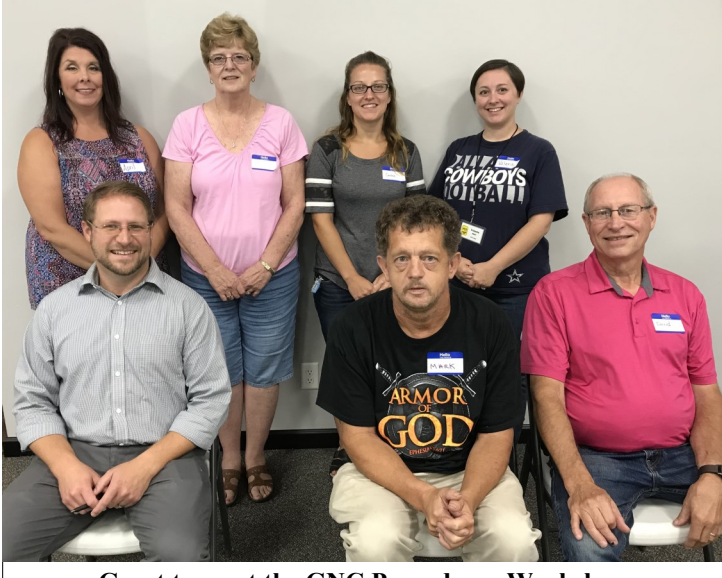
Great team at the GNC Procedures Workshop

The people pictured to the right came out to a Good News Club® (GNC®) Procedures Workshop on Sept. 14 to discover each of their roles in starting this club. A certificate stating that Zion's Refuge Baptist Church (ZRBC) adopted the Mifflin Elementary School GNC on this day of training.