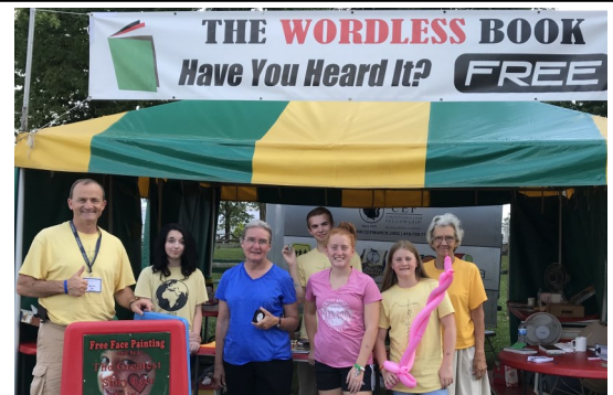
Crawford County Fair in Bucyrus