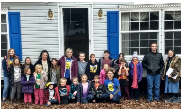
Solid Rock Good News Club, Hickory Grove mobile home park in Johnsville.

God blessed us with $30,000 through the Christian and Missionary Alliance Dream Grant program. We saw God work miraculously and bring our seller right to us! The dear lady passed away on December 26, very suddenly. We believe God allowed her to perform her last act of obedience by selling her doublewide mobile home to us for far less than she could have received.