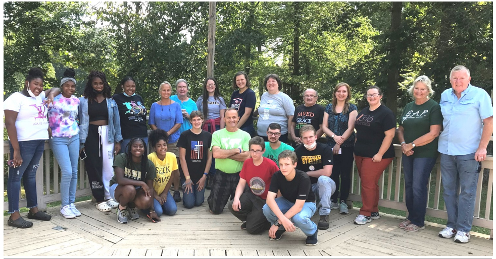
Christian Youth In Action Summer Celebration 2021