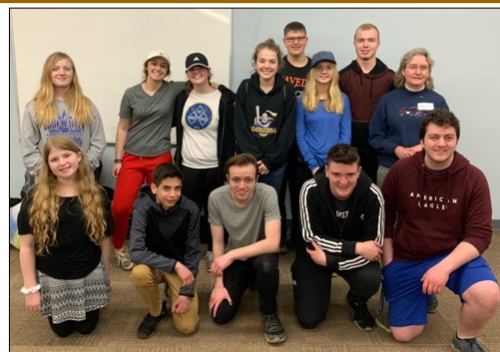
MARCK Chapter youth at this year’s retreat!

Scholarships: This year we have scholarships available ($300/person) for the first ten students who apply and are accepted. An additional requirement is that each youth involved is