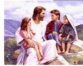
“Kids for the Kingdom”

Non-Profit Org. U.S. Postage PAID Mansfield, Ohio Permit #385