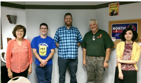
TCE™ Class of 2017