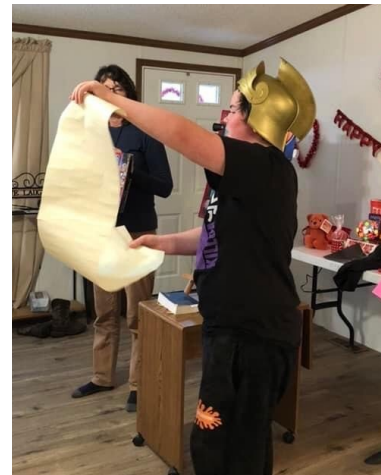
Solid Rock Good News Club at Hickory Grove Mobile home park in Johnsville

God has given us many opportunities to share His love through teachings, various interactions with the children, praying for their individual prayer requests, and at times ministering to the physical needs of their families. God has answered some very specific prayer requests! Several children have professed Christ, with one desiring to be baptized soon. Please pray with us that entire families will be saved through the ministry of Good News Club. May our Lord protect and complete the work He is doing in this neighborhood!